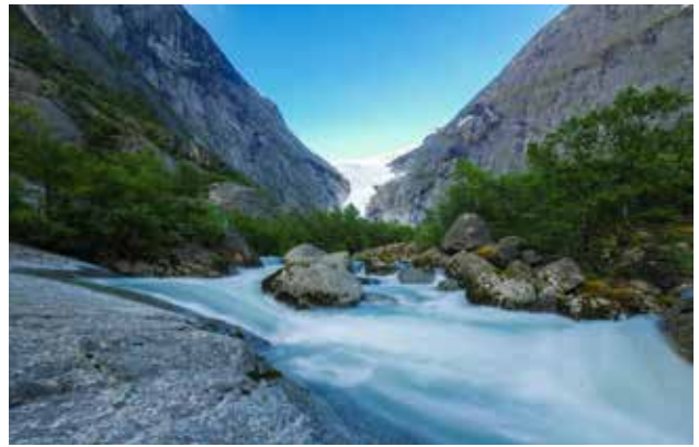
Briksdal Glacier in Olden