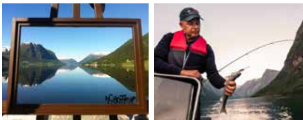
Photo-frame with view of the Jølstravatet lake and trout fishing

Skei (also known as Skei in Jølster) is a beautiful village located at the northeastern end of the Jølstravatnet lake, just west of the Jostedal-breen National Park. The area is shaped by water in constant movement and has inspired artists, fiddlers and poets for centuries. This is also the home of the world-famous painter Nikolai Astrup (1880 - 1928), who found inspiration and motifs in the surrounding nature. Popular attractions are glacier hiking, trout fishing, kayaking and a visit to the historical home of Astrup.