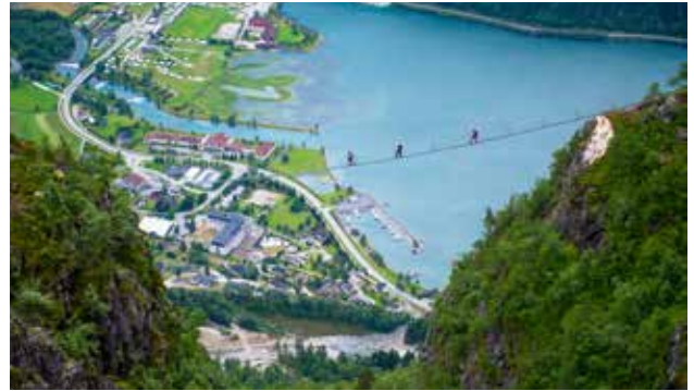
Via Ferrata Loen