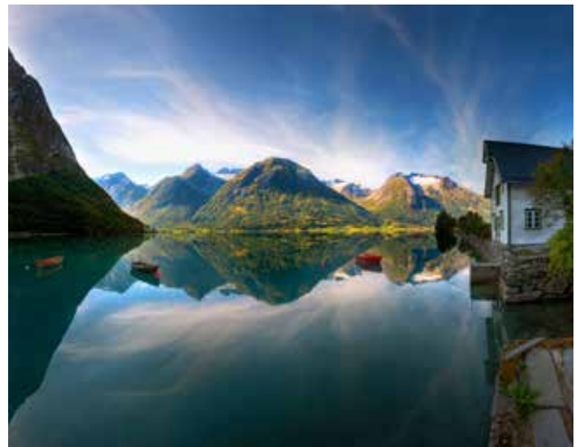
Lake Oppstrynsvatnet

The road brings you past Hjelledalen Valley, across the mountain and to the spectacular viewpoint Flydalsjuvet, where you can absorb the magnificent view of the Geirangerfjord, before heading down the scenic road from Dalsnibba to Geiranger.