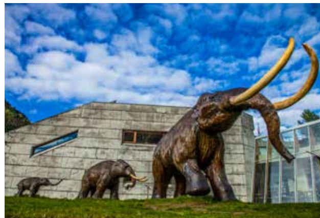
Norwegian Glacier Museum

In this interactive museum you learn about glaciers and climate in a new and innovative way. The interplay within the natural environment and between mankind and nature, is highlighted through film, interactive models and individual experiments with real glacier ice.