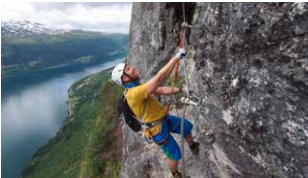
Via Ferrata Loen

The Via Ferrata Loen is a climbing route where you are secured in a steel cable, while climbing high above the fjord. You end up at Mt. Hoven, and return to Loen in the Loen Skylift