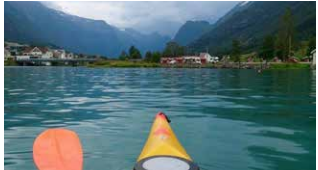
Kayaking on the Nordfjord

The kayaking trip in Olden takes you out on a green fjord in a quiet valley, you are surrounded by steep mountains, soaring waterfalls and blue glaciers. An experience you will treasure for the rest of your life!