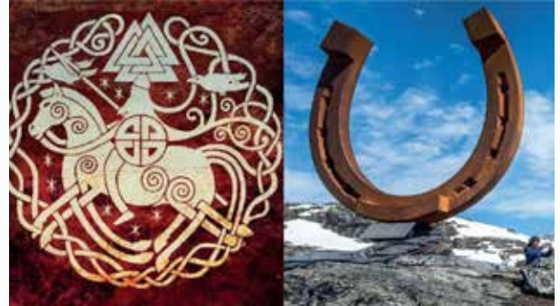
Drawing of Odin on Sleipner, and Sleipner's horse shoe at Mount Hoven