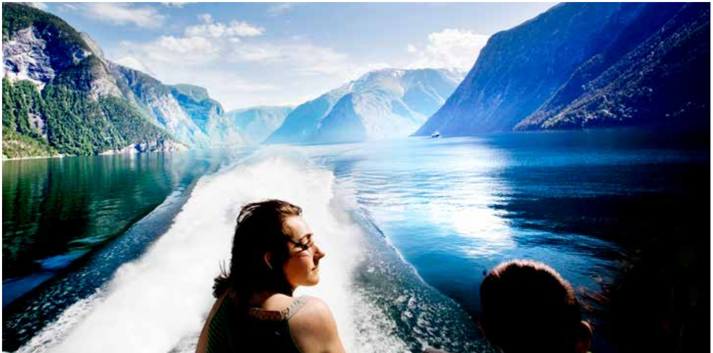
The Sognefjord - the King of the Norwegian fjords

The Sognefjord is often called "The King of fjords" and extends 204 km (127 miles) inland, has a maximum depth of 1,308 metres and the mountains surrounding the fjord tower to heights of 2,000 metres. The inner end of the Sognefjord is covered by Jostedalsglacier, the largest glacier in continental Europe.