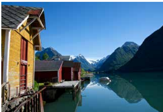
Fjærland, Fjærlandsfjord and the glacier in the mountains