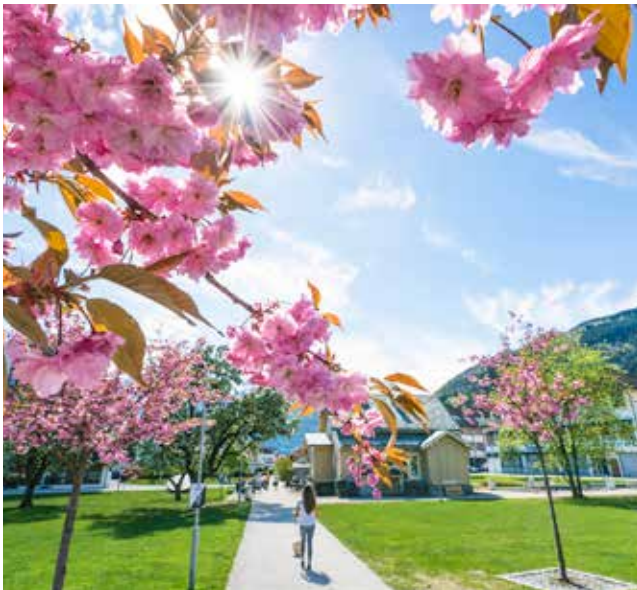
Sogndal city park