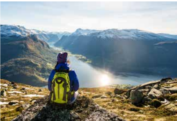
Hiking at Mount Hoven in Loen