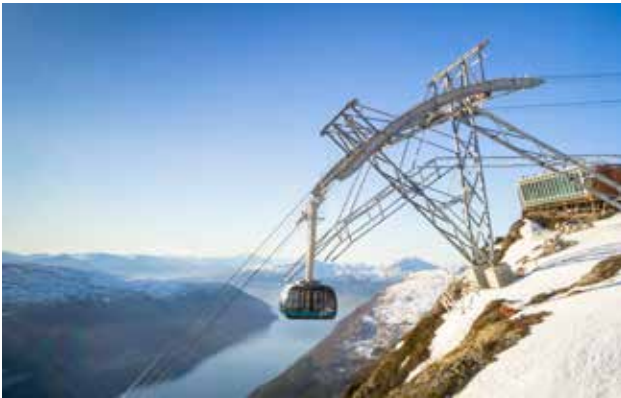
Loen Skylift

Take the Loen Skylift from the fjord to Mt. Hoven (1 011 m.a.s.l.), and see the fjord landscape, the mountains and the Jostedalbreen National Park from above.