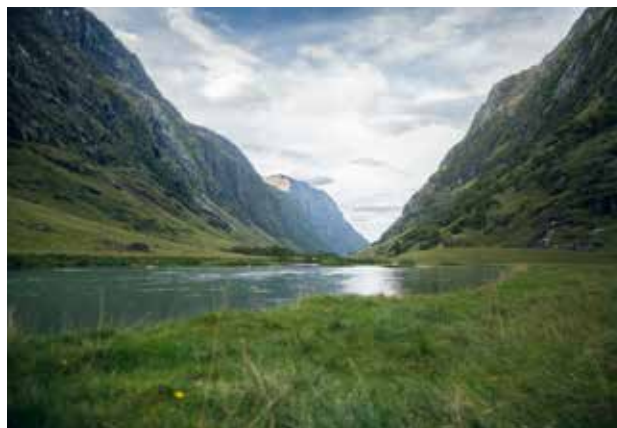
Våtedalen valley

Våtedalen valley is the entrance of the Nordfjord region. Here you'll meet some of the local goats that groom the green hillsides. The area is known for agriculture and salmon fishing, and houses the cultural heritage object Holvikejekta, a unique 20 m sea vessel from 1881. You will be passing Byrkjelo and Mt. Eggenipa.