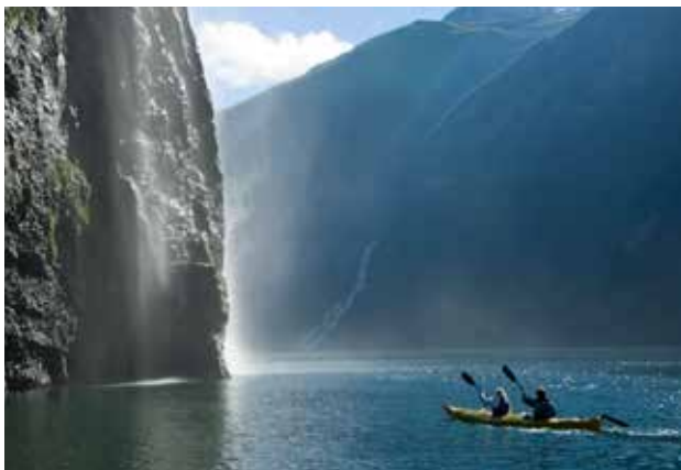
Kayaking in Geirangerfjord

Geiranger can also be a good connection further to/from Ålesund.