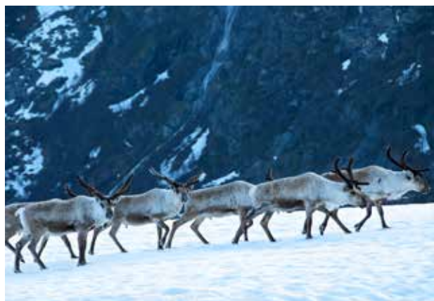
Reindeers in the mountains

Crossing Mt. Utvik you might be lucky and see grazing reindeer! Popular outdoor recreation area with ski centre and hiking trails.