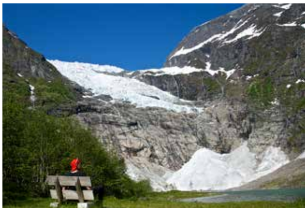
Bøyabreen Glacier in Fjærland

You can see Bøyabreen Glacier at quite close range from the main road in Fjærland, or admire it from the Brevasshytta restaurant a five-minute drive inland, even closer to the ice. If you are lucky you can see big blocks of ice crashing down from the glacier.